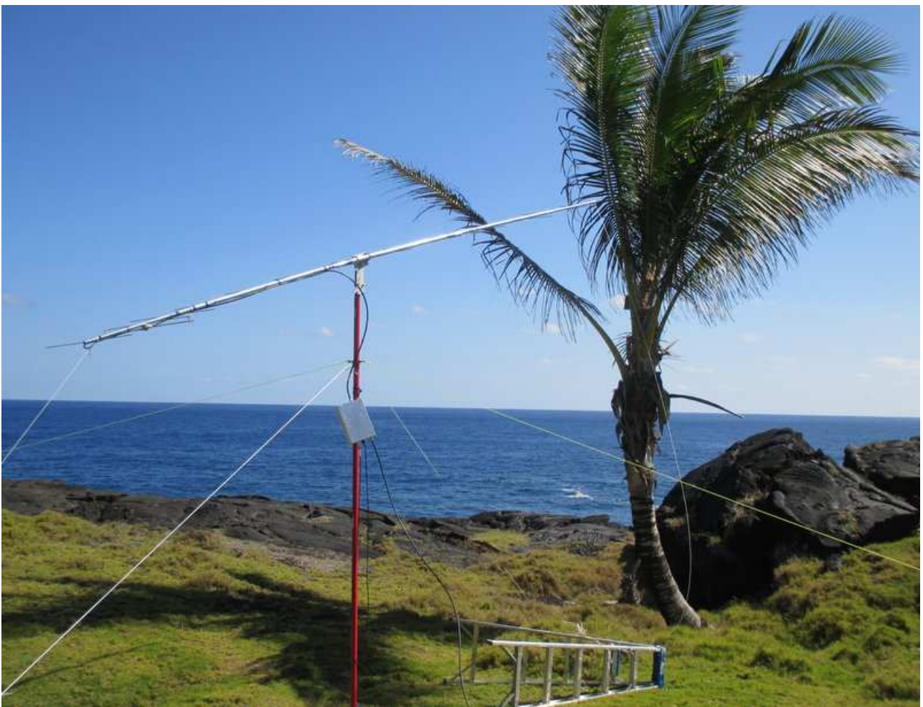
Isn't that a beautiful take-off in BK29MO?