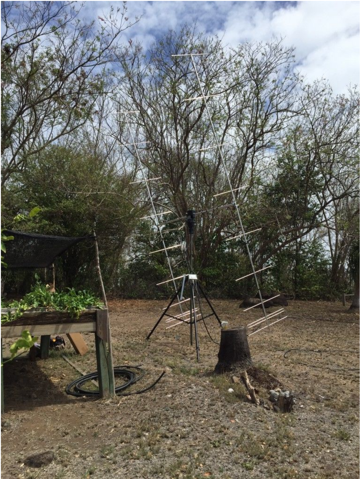
The two 9 elements yagis at J8/WW2DX

team. So Lee will be QRV from another much wanted DXCC from 19 th to 29 th August. Details are on http://www.cy9dexpedition.com/index.html