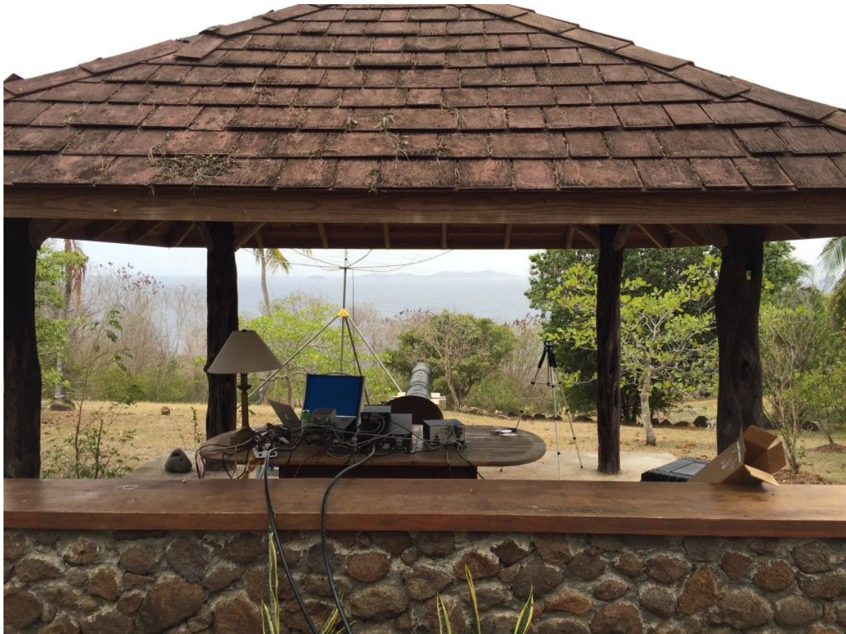
The outdoor shack with perfect view to the ocean.

Antennas used were a pair of 9 elements yagis (InnovAntennas), vertical polarised and stacked horizontally. Right upon arrival on the 21 st Lee started setting up the station and was QRV within only a couple of hours. When everything was ready he first checked the band and noticed a CQ by PA5Y which he answered. Conrad sure was somewhat surprised... after that QSO J8/WW2DX moved to a different frequency and started working in DXpedition mode. Though it was early morning in Europe the screen soon filled with syncs from callers. 33 stations worked in just a few hours is not quite bad. The following day another 41 stations were added to the log, and 26 QSOs followed on March 23 rd . At the end of the DXpedition on March 26 th a total of 153 EME QSOs was in the log, what a success! Last station worked was lucky Udo, DK5YA.