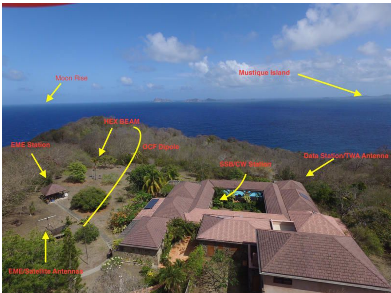
Air view of the DXpedition QTH: The EME shack is located in the small "hut" to the left.