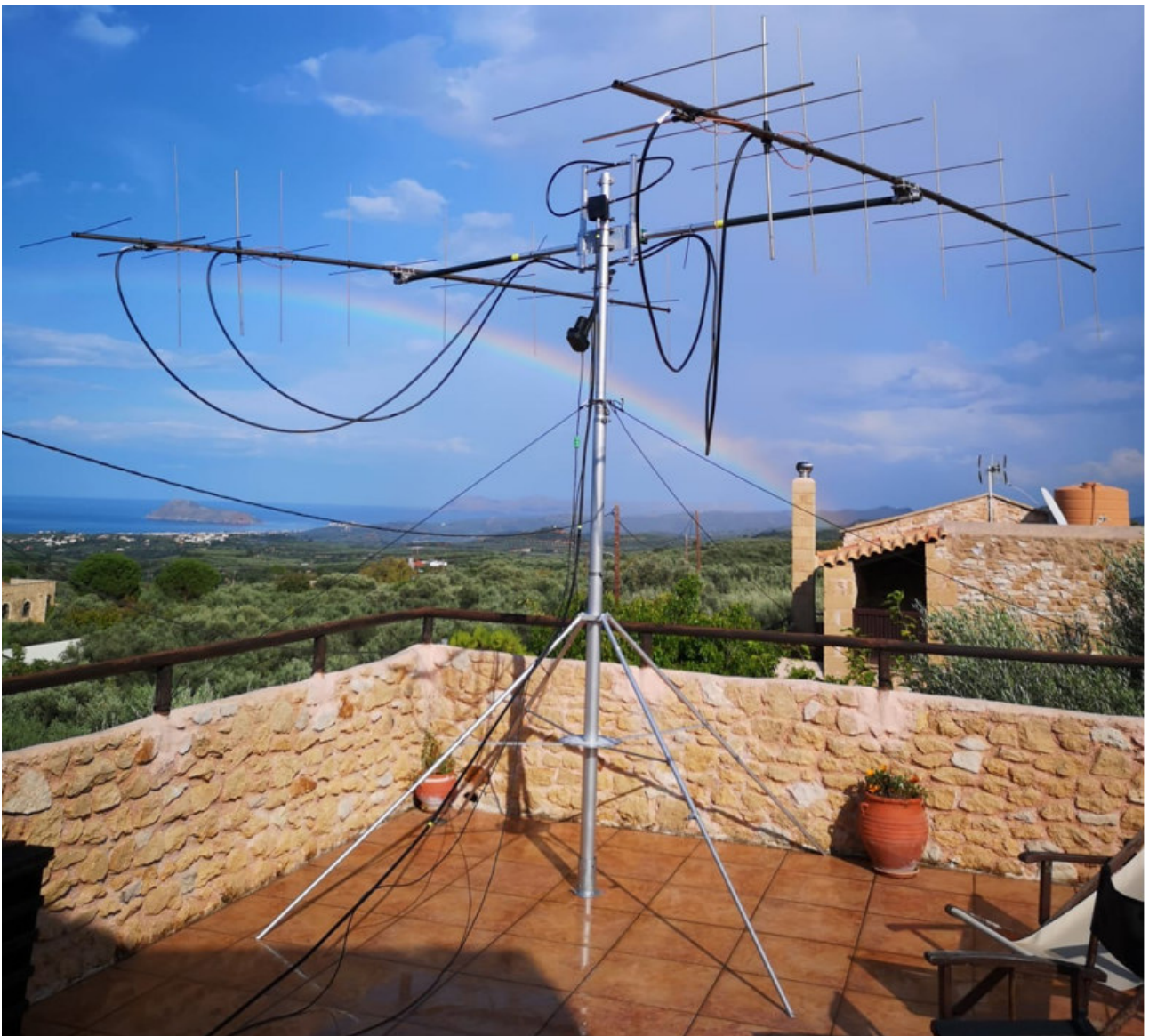
The roof garden made setting up the two yagis very easy.

Unless you live in a country with many never activated grid squares such as the USA with KA6U's activities - the past nearly two years were not easy for those planning for DXpeditions. Even few days before departure there could still be the need to cancel everything altogether, due to COVID.