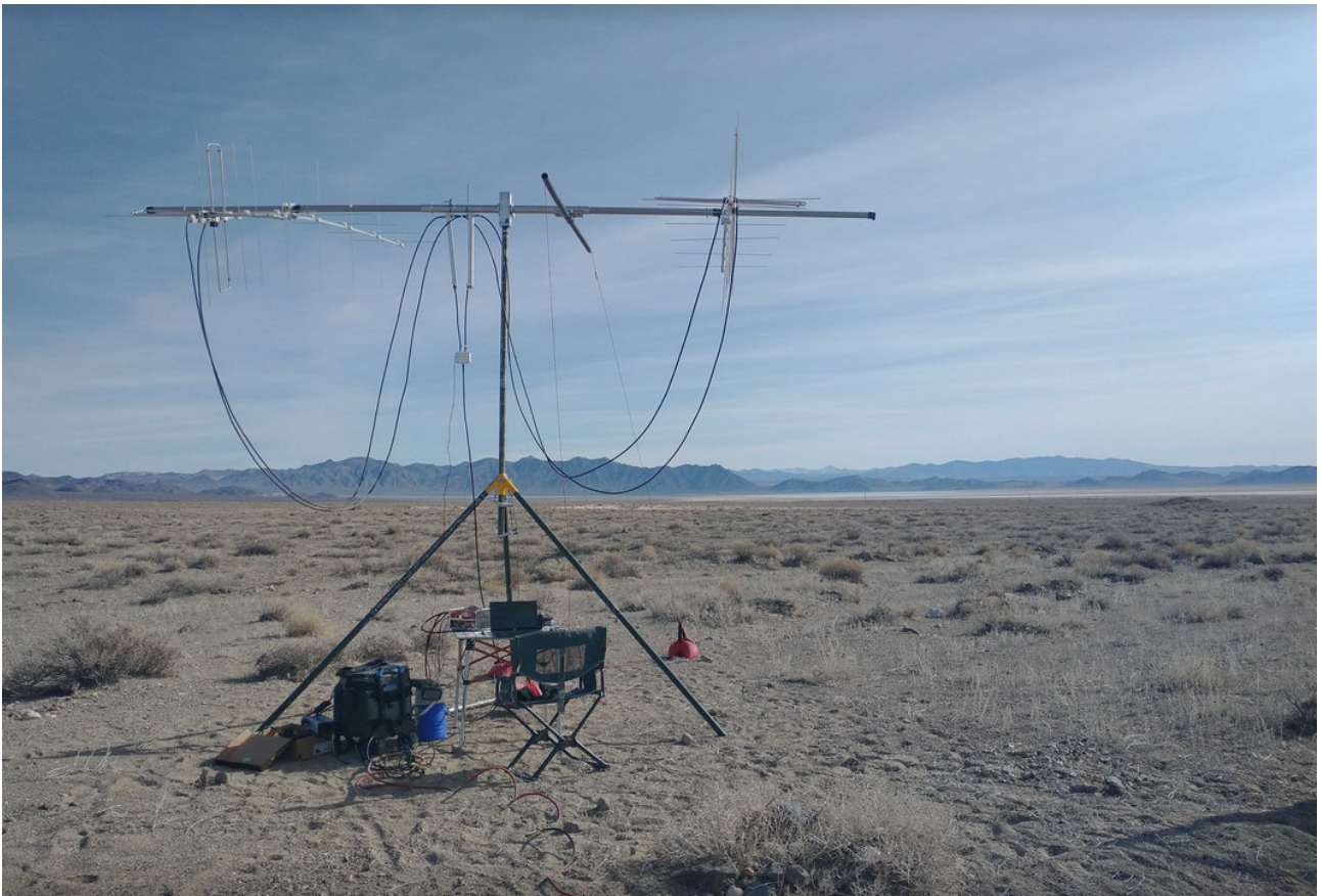
AG6EE's setup from DM08 on February 5 th in the desert.