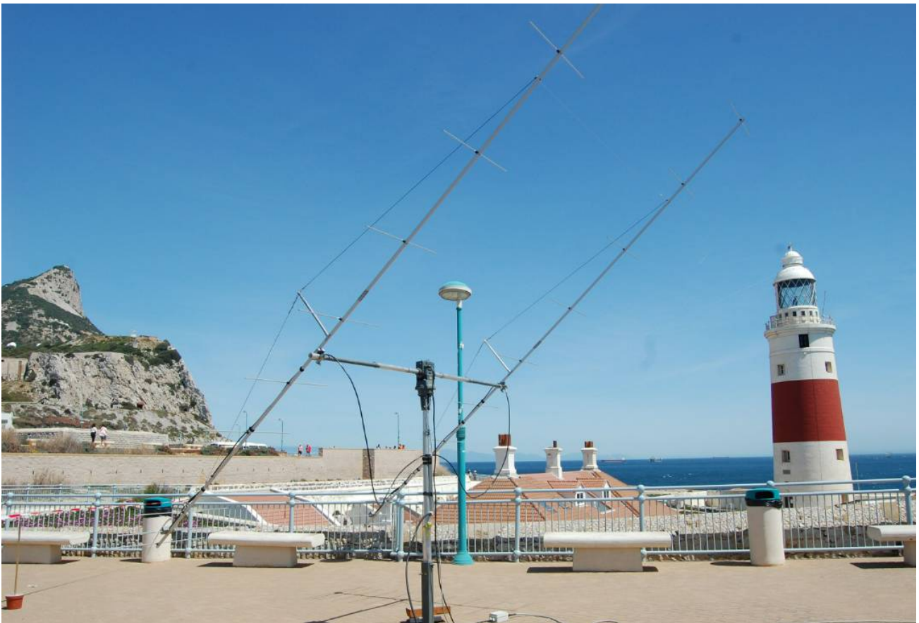
The two yagis were situated close to Harding's battery and the Europe Point lighthouse.