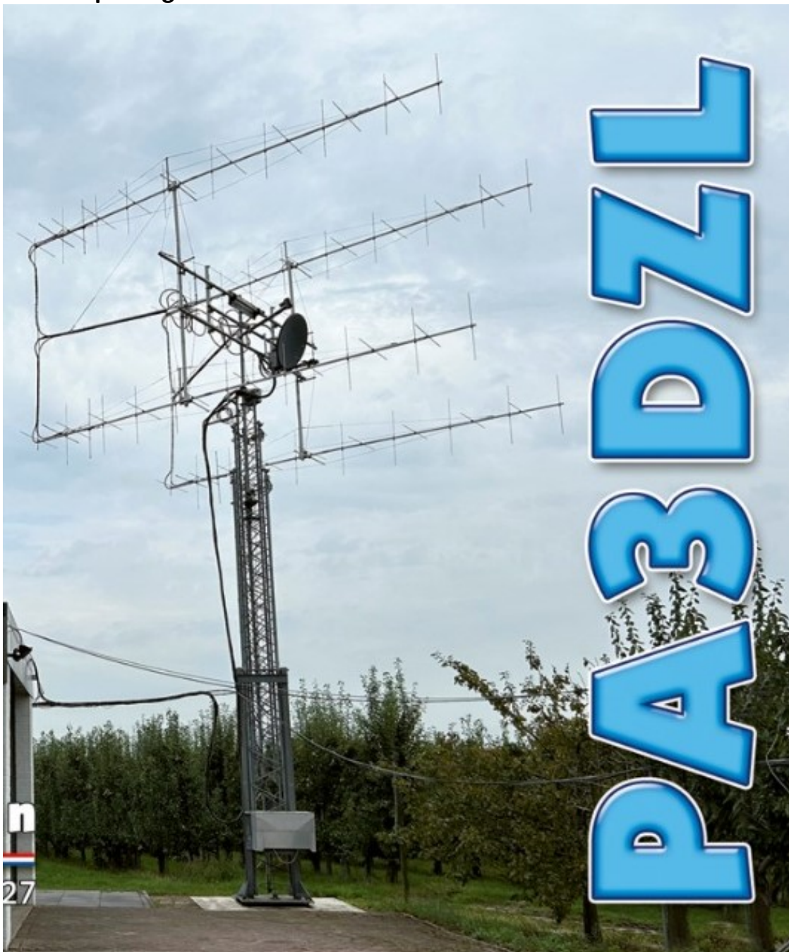
Jac runs four 10 ele H + V yagis on 2 m. The dish is for UHF and SHF.

Jac PA3DZL reporting about his recent 2 m activities